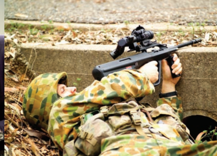
Off-Axis Viewing Device (OAVD)