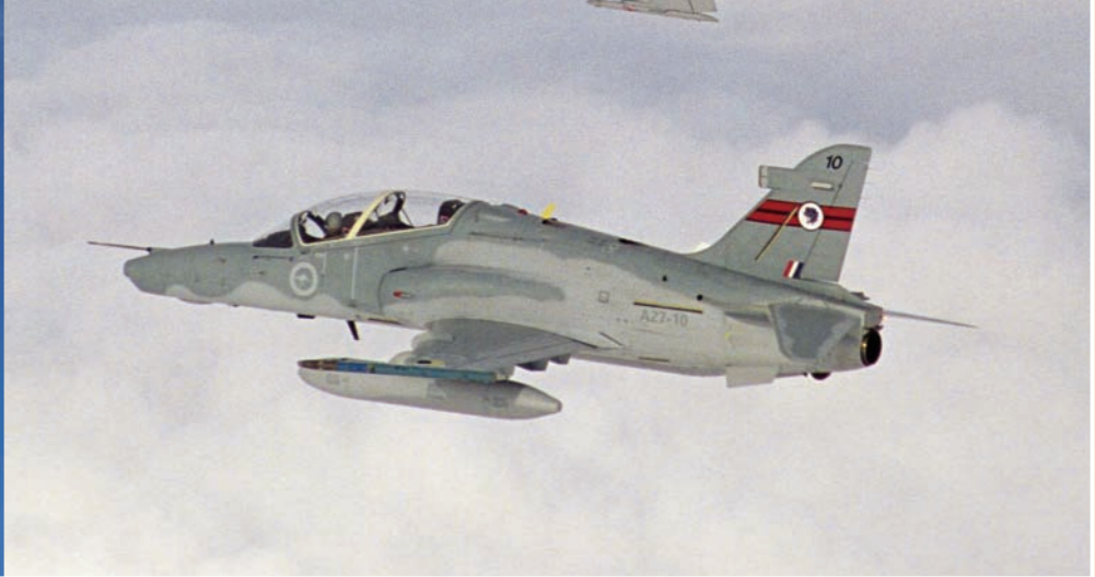
Hawk Lead-in Fighter