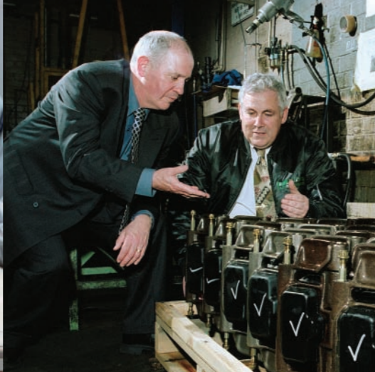
Tracked Vehicle Elastomer and Associated Technologies