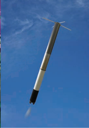
Nulka Active Missile Decoy