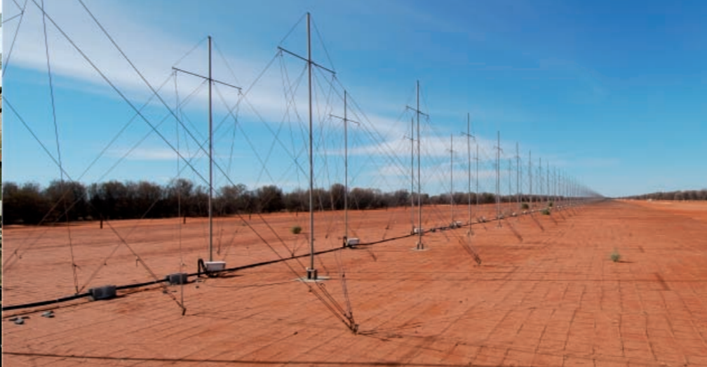
Jindalee Operational Radar Network