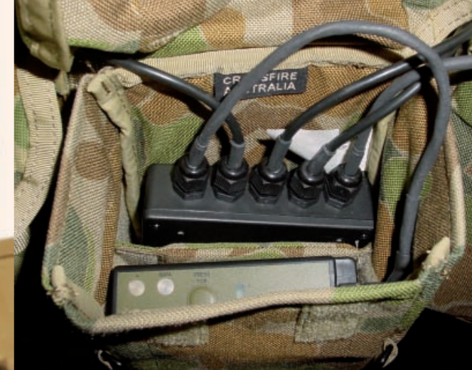
Smart Power Management