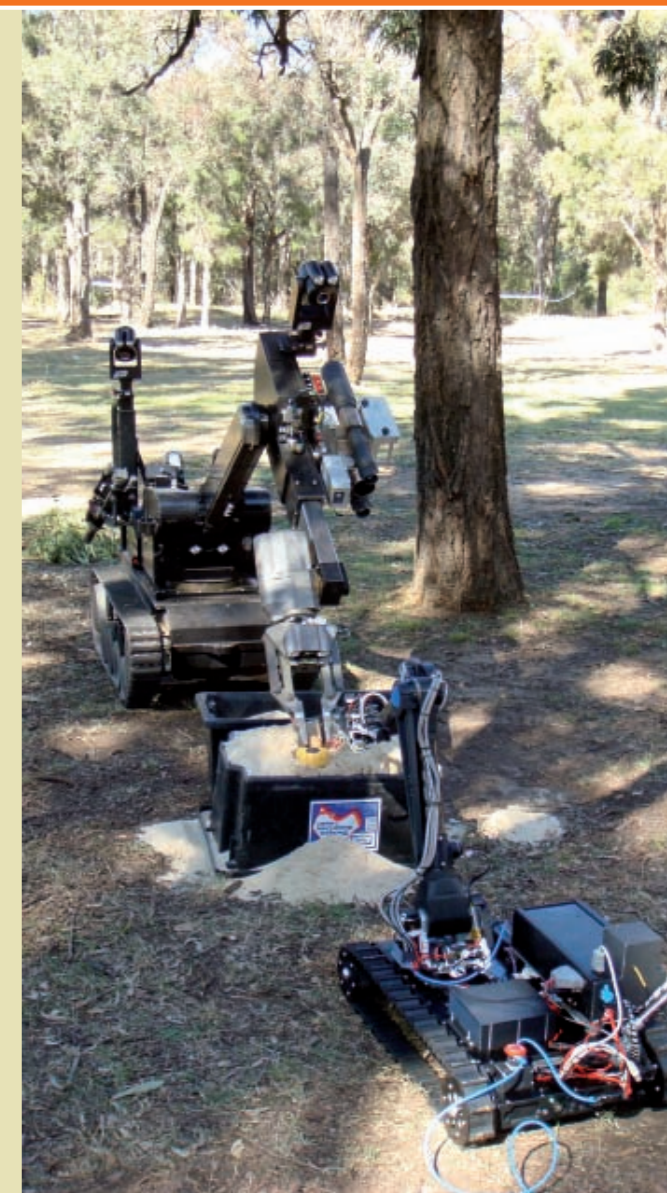
Haptically Operated Robot

Remotely operated robotic devices can be used in the safe neutralisation of roadside IEDs (Improvised Explosive Devices), the removal of hazardous materials, and eventually in battlefield surgery. In addition to its Defence applications, the technology has the potential to be used in the medical and gaming sectors.