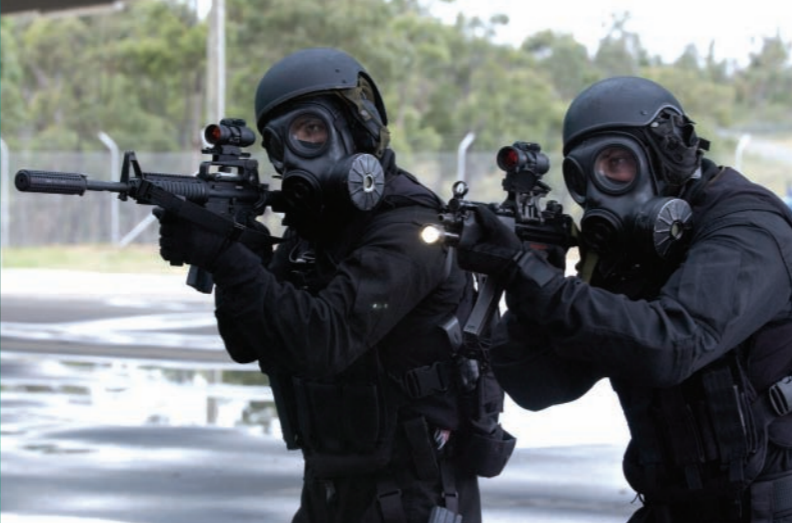
Chemical Biological Combat Suit