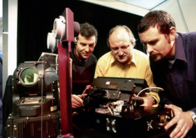
Multi-Band Research Laser Infra-Red (MURLIN)