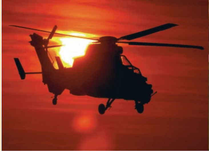
Armed Reconnaissance Helicopter