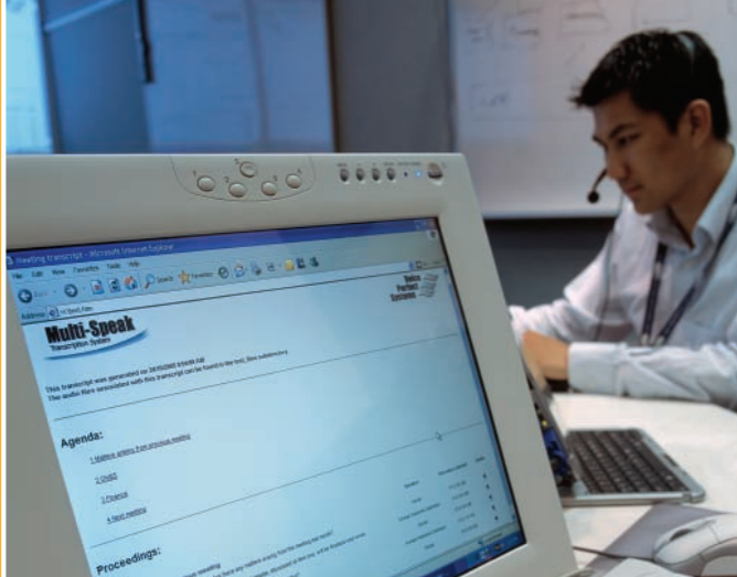
Automatic Transcriber of Meetings (AuTM)