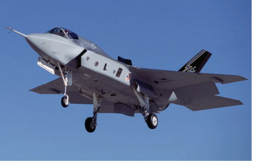
Joint Strike Fighter