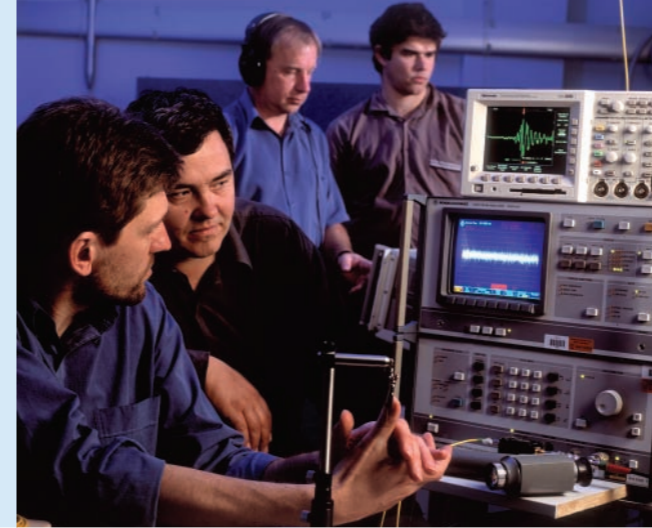
Receiving soundwaves through fibre optic cable (Hydrophone)

The Defence Science and Technology Organisation (DSTO) is part of Australia's Department of Defence. DSTO is the Australian Government's lead agency charged with applying science and technology to protect and defend Australia and its national interests.