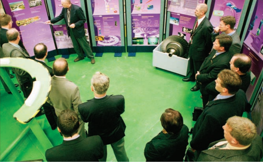
Defence Industry Study Course