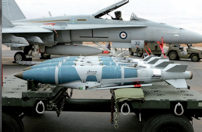
Joint Direct Attack Munition – Extended Range (JDAM-ER)