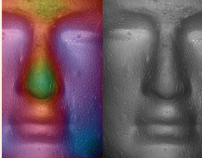
Quantitative Phase Imaging